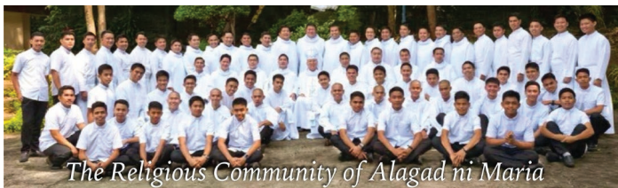
The Religious Community of Alagad ni Maria