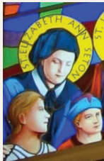
St. Elizabeth Ann Seton is depicted on our stained glass window in the Main Sanctuary.

Mother Seton is one of the keystones of the American Catholic Church. She founded the first American religious community for women, the Sisters of Charity. She opened the first American parish school and established the first American Catholic orphanage. All this she did in the span of 46 years while raising her five children.