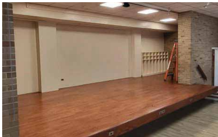
Photo of the stage; decluttered, painted, and the floors refinished!

Please plan to donate on Sunday June 11. Registration details available soon.