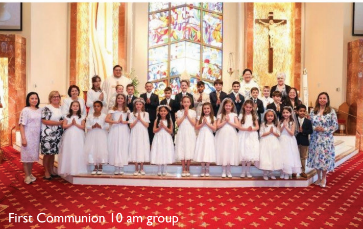
First Communion 10 am group