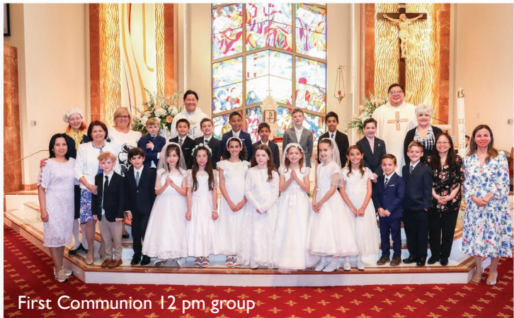
First Communion 12 pm group