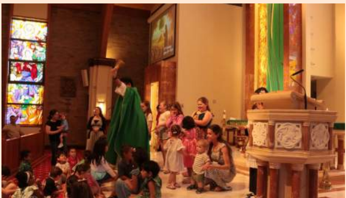
Fathers' Day Blessings