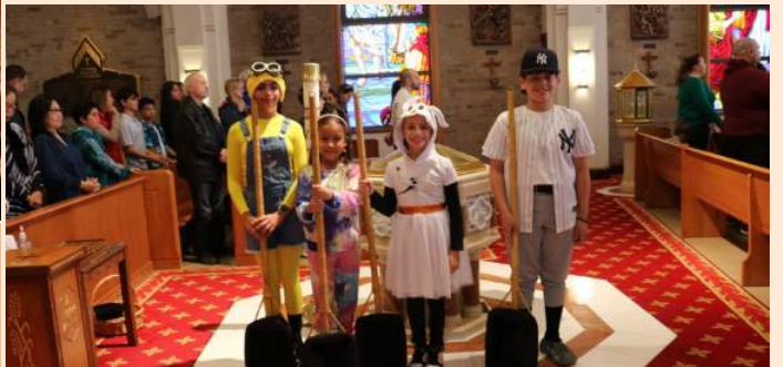
Gift Offerings - The Dhingra Family