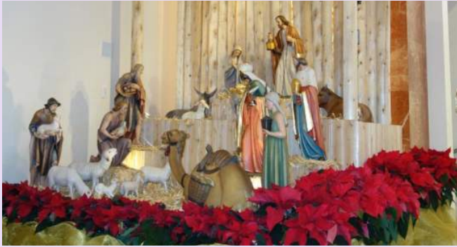
Lighting of Advent Candle and Building the Manger

Advent (from advenire in Latin or "to come"), the beginning of the Liturgical Year, is the season consisting of the four Sundays (and weekdays) leading up to the celebration of Christmas.