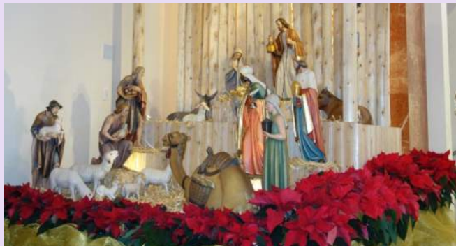
Lighting of Advent Candle and Building the Manger

Advent (from advenire in Latin or "to come"), the beginning of the Liturgical Year, is the season consisting of the four Sundays (and weekdays) leading up to the celebration of Christmas.