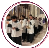
Meet our priests and seminarians