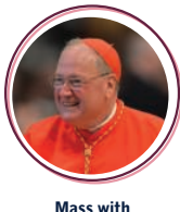
Mass with His Eminence Cardinal Dolan