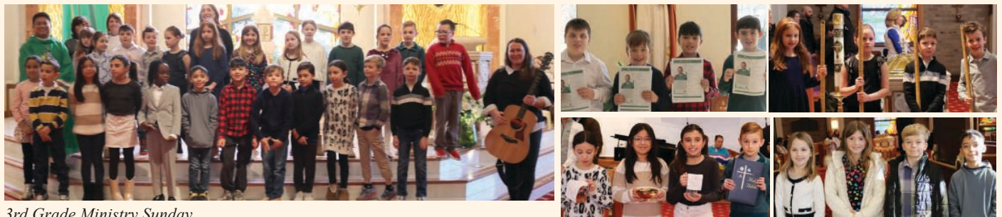
3rd Grade Ministry Sunday.